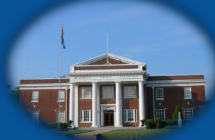
McCormick County Courthouse