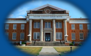
Saluda County Courthouse

Contact us 803.785.8352 Solicitor11.sc.gov Solicitor11@lex-co.com