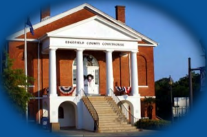
Edgefield County Courthouse

Our commitment to training the next generation of prosecutors is one of our office's primary focuses. You will gain immediate courtroom experience and have an opportunity to work on violent crimes. You will be trained by some of the most successful and experienced trial attorneys in the State.