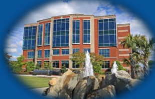
Lexington County Courthouse